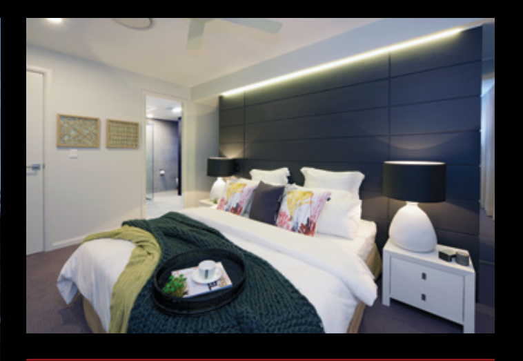
WE DESIGN AND BUILD YOUR HOME TO BE AS INDIVIDUAL AS YOU ARE